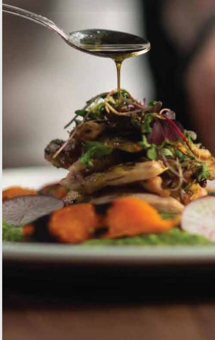
Al Waha Main Dining

Immerse yourself in the rich spices of Saudi cuisine, the authentic tastes of Italian delicacies, or the familiar comforts of American classics.